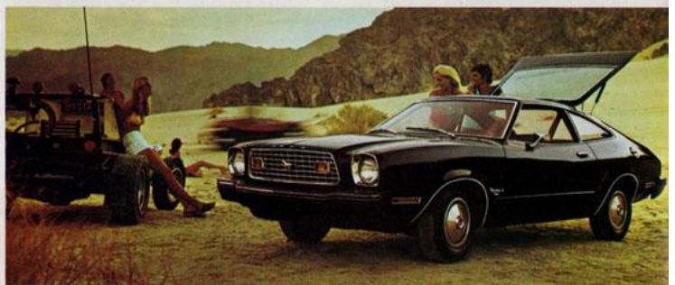
Mustang II MPG 3-Door 2+2 with Stallion Option Group

Mustang II MPG 3-Door 2+2 (below), in Black (Code 1C), features bright moldings throughout, and a bold, bright grille.