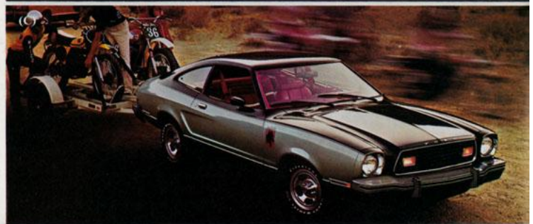
Mustang II Mach 1