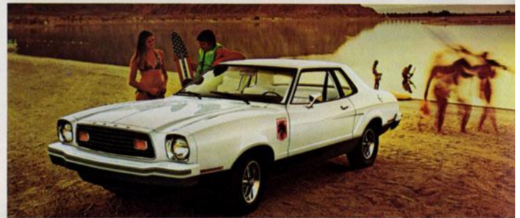
Mustang II MPG Hardtop

Mustang II MPG Stallion Hardtop (below) shows the exciting new look you get with a Polar White exterior (Code 9D) set off with Stallion Group items like: Black grille/bright surround molding, Black moldings/wiper arms, Black-painted lower fenders, lower doors, lower front/rear bumpers, rocker panels and all the other features listed for Stallion 2+2 on page 2. Other Stallion colors available in combination with Blackout areas and items are: Silver Metallic, Vermilion, Bright Yellow (see page 2), and Silver Blue Glow. Trim rings shown are optional.