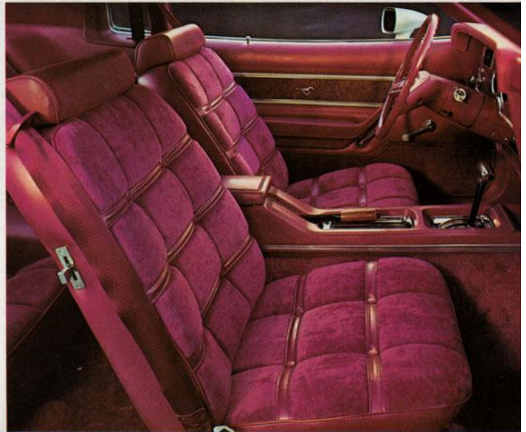
Mustang II MPG Ghia Hardtop with Ghia Luxury Group

Digital Clock (above), an optional, contemporary timepiece, features quartz crystal controlled accuracy.